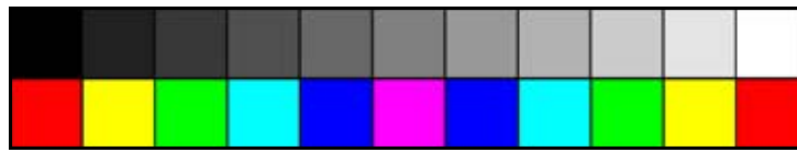
The Digital Zone System